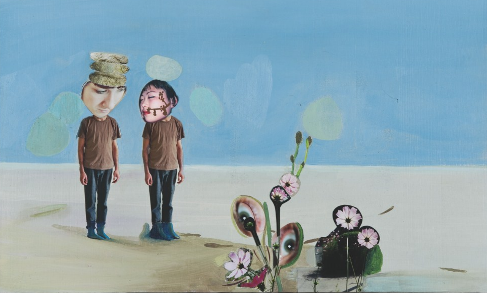
Crossing Borders -- Blurring Borders through the works of Ursula Hübner