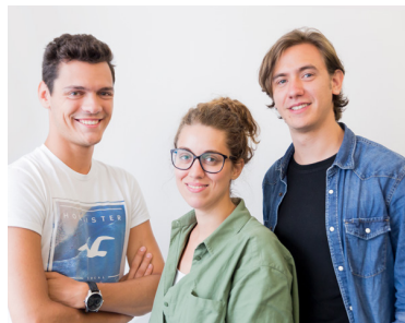
Summer of Thinx_2016

At denkwerk thinx , we experiment within the areas of communication, networking, user experience and interaction to make new social and digital possibilities tangible. For example, how can we communicate using devices without screens now and in the future, or rather how can they more subtly communicate with us? The thinx lab is equipped with everything necessary to realize ideas and build prototypes, e.g. Arduinos, a 3D printer, assorted tools (sewing machines, soldering irons, saws etc.) and diverse materials (wood and textiles). It's the denkwerk "playroom for experiments".